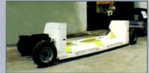
Axles can be added to make this unit towable on road

Our Security Mobile Barrier SMB T1000 is crash tested to withstand a 6.8 ton medium truck traveling at 50 km/h and stopping it within 15 meters. Designed to be towed or lifted by crane into action, the barrier can be deployed in less than 15 minutes. This enables key installations, military camps, hotels, shopping centers, conference and convention centers as well as any buildings and locations to quickly set up critical vehicle control points according to the changing threat level.