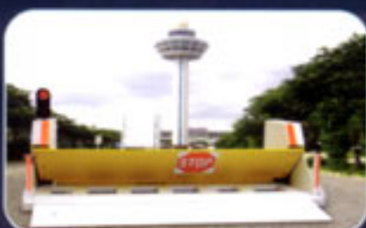
Deployed at Changi International Airport, Singapore