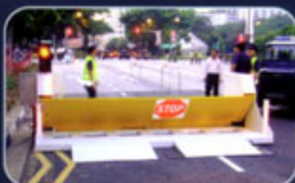
Deployed at Singapore National Day Parade 2005